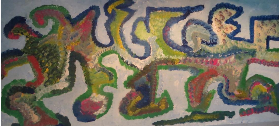
Voices in my back

“Art opens your eyes to three very important realities. Even if you only see one of the three, it can already make you a much happier person. The three of them form an extremely intoxicating happiness cocktail. Being: